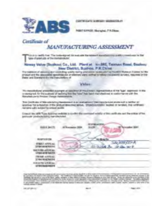
" # 4