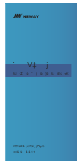
<:/S'òvÙ $ # ' 7