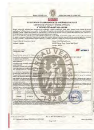
$ & 1 & %