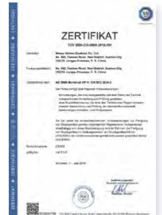
" 1 * %