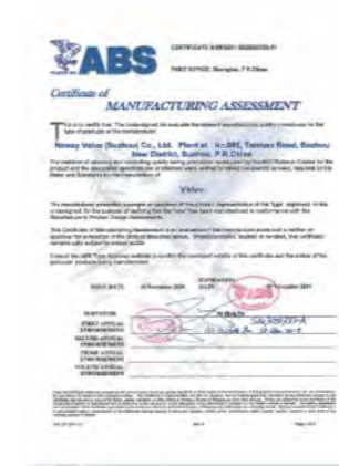
" # 4