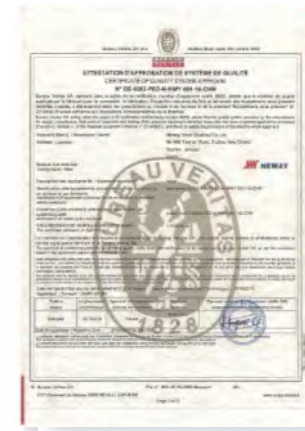
$ & 1 & %